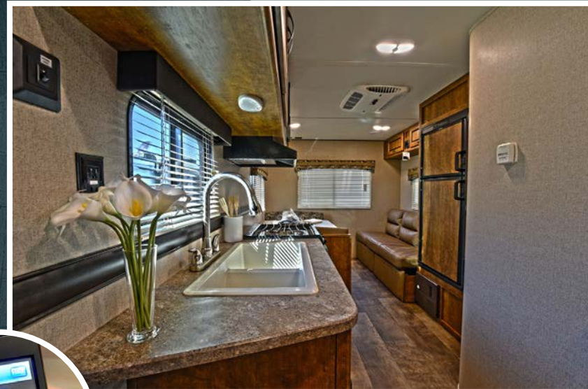
280RK Dining Slide