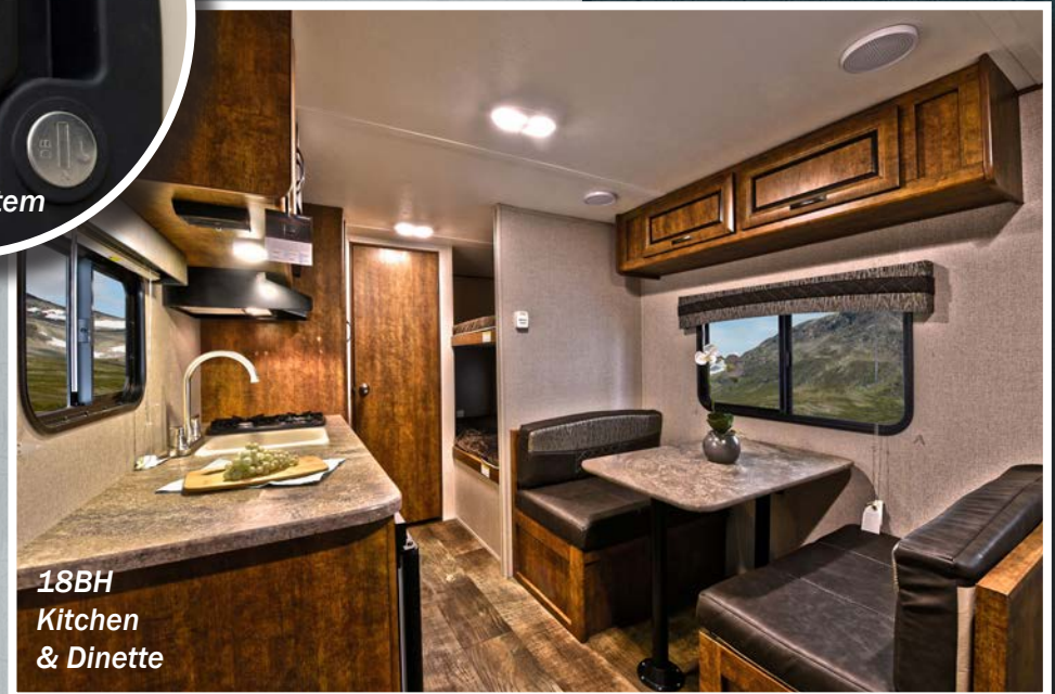
18BH Kitchen & Dinette