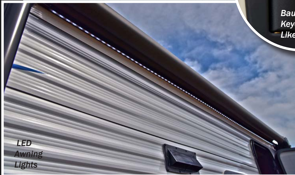
LED Awning Lights