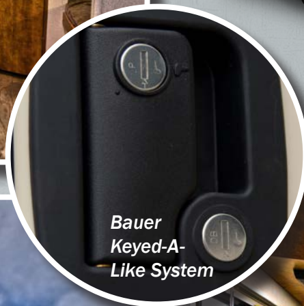
Bauer Keyed-A- Like System